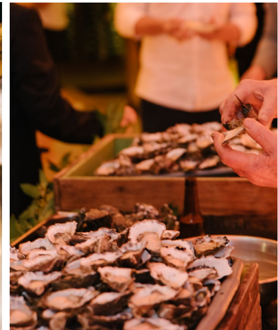
Specialty Food Stations